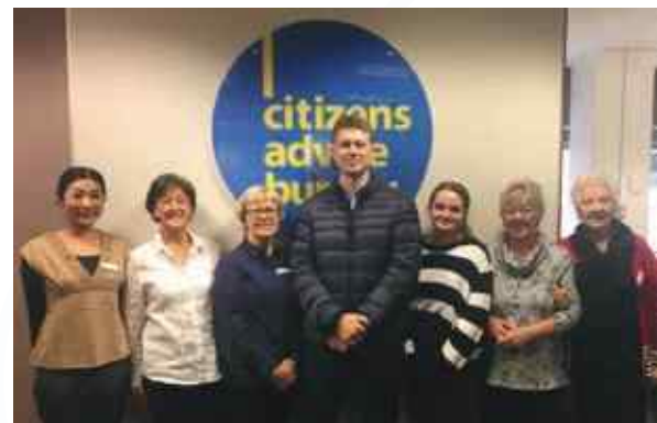
CAB welcomes volunteers from all backgrounds although achieving gender balance on any given day is harder than you may think.