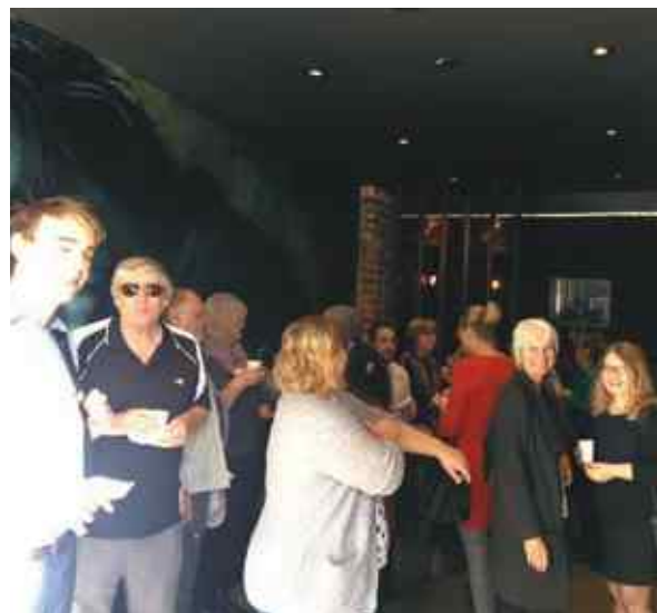
To celebrate National Volunteer Week, we took our volunteers to The Backlot Studios in West Perth for a private screening of "Swimming with men" and a delightful morning tea.