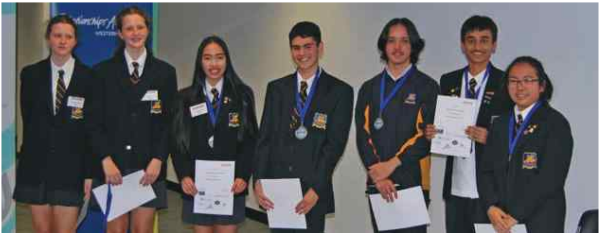
Perth Modern School – SCRAM grand final 2018 winning team.

"As a mediator (adjudicator), I thoroughly enjoy the energy that the students bring to their role-plays and personally witnessing their learning journey in dispute resolution."