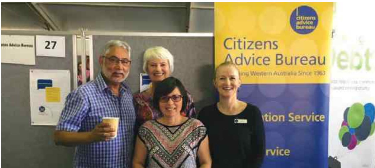
CAB participates in Homeless Connect each year to provide information and referrals to people who are homeless or at risk of homelessness. We can cover a wide range of matters and aim to give a few options so they can make their own independent decisions.