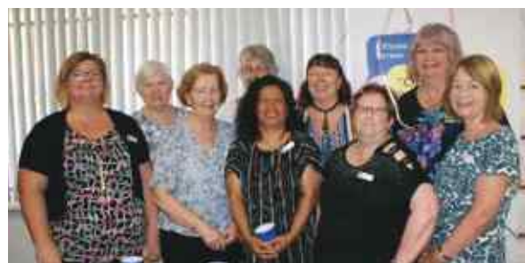
Armadale volunteers at the celebration of the 15th Anniversary of the branch in February 2019.