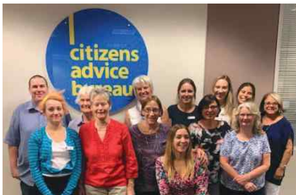
Meet our wonderful Wednesday team!