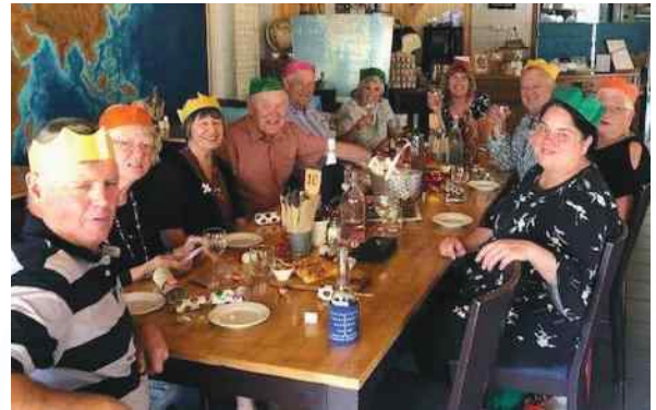
The Busselton volunteers enjoying a festive Christmas lunch.