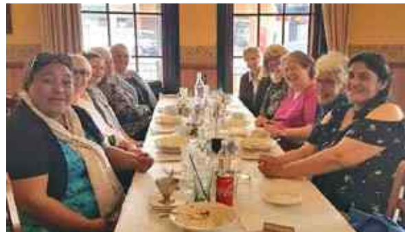
The Midland volunteers showing their strong bond in and out of the office.

Volunteer & Client Services Coordinator On behalf of the Midland Branch