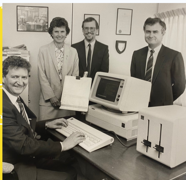
From the Archives

Thanks to the fabulous efforts of our staff and volunteers, CAB has emerged from COVID times well placed to continue its dedicated work connecting people with information and services to assist them in making informed and independent decisions. Our sector has been no less demanding than previous years with an increase in volunteer movements.