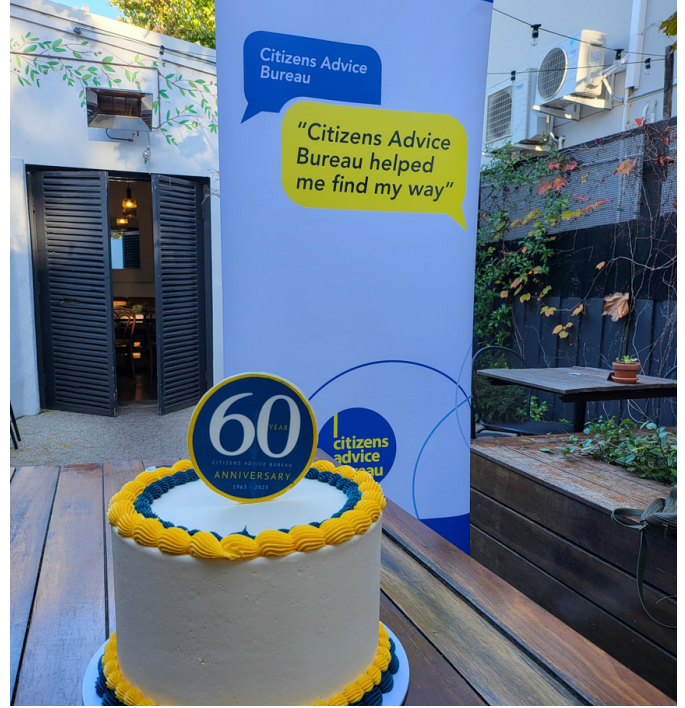
CAB's celebratory 60th Anniversary cake as displayed at the event.