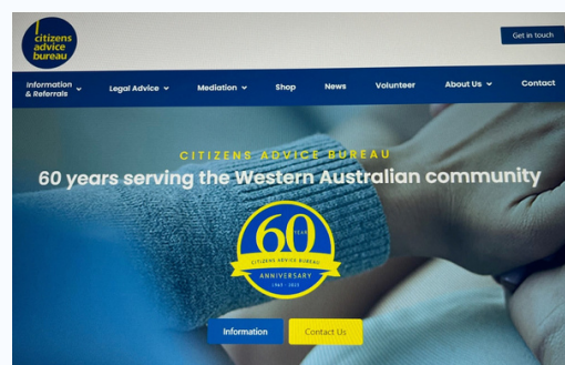
CAB's new website designed by Power Creations.

The new website is: www.cabwa.com.au and can also be accessed via mobile phones.