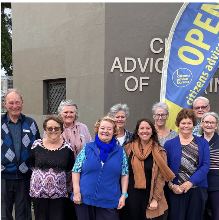
From left: Mandurah volunteers standing proudly with CAB Volunteer and Client Services Coordinator in front of the Mandurah Citizens Advice Bureau branch.

Mandurah branch held its Annual Branch Meeting in mid-July where committee members and volunteers alike discussed ways to improve services to the Mandurah community by sharing ideas and creating positive discussions.