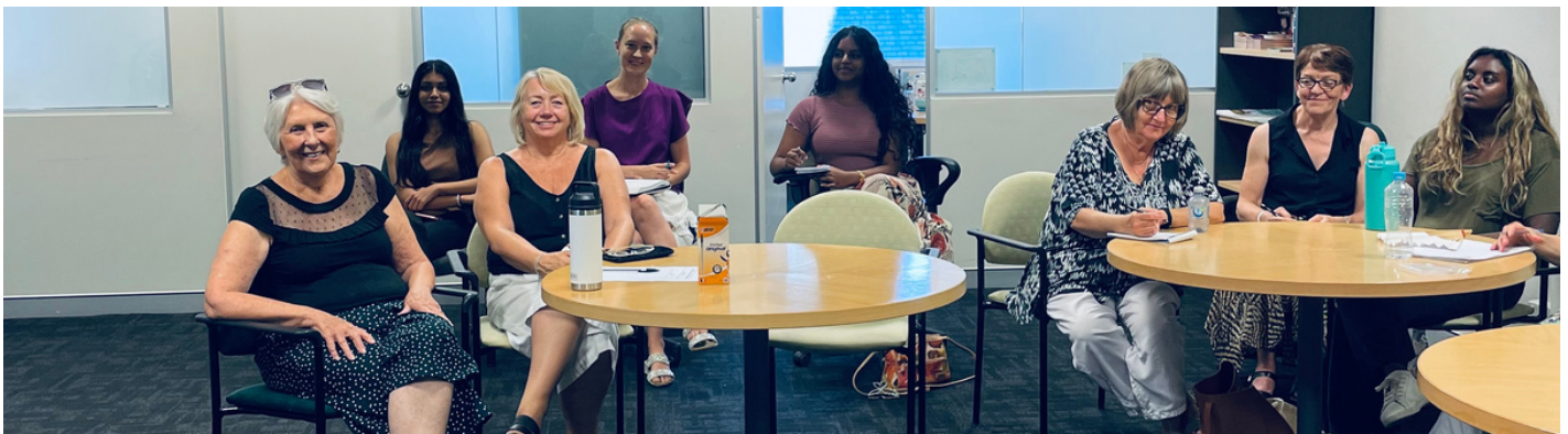
CAB volunteers at the Criminal Injuries Compensation training held at the Perth Branch.

CAB strives to continuously provide ongoing training and works diligently to ensure that all CAB volunteers have access to the most relevant and up-to-date information in order to provide our clients with the most accurate community referrals.