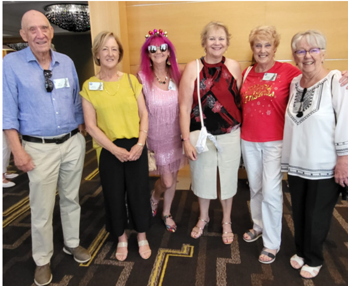
From left to right: CAB volunteers get together for the End of Year Celebration.

CAB enjoys taking the opportunity to acknowledge and express our endless gratitude and appreciation to all the volunteers whom which the organisation simply could not operate without. The Western Australian community greatly benefits from the time CAB volunteers devote weekly, and getting together and praising this great achievement is indeed a worthy cause.