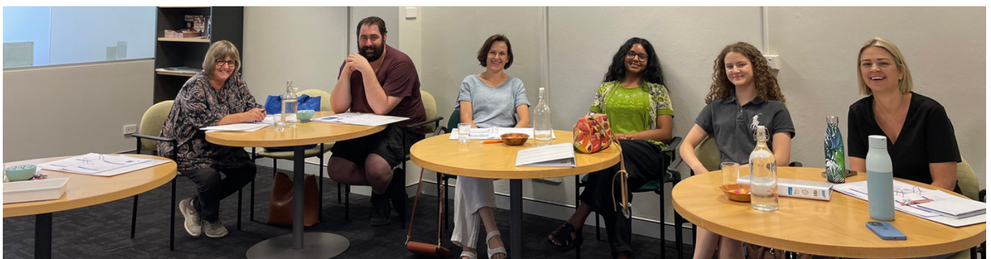
New volunteers from various CAB branches attend the two-day volunteer training which is presented at CAB's Perth Branch by the Volunteer and Client Services Coordinator.

This training is beneficial to volunteers and allows them the opportunity to ask questions, get informed, feel more comfortable in their role and gain confidence in helping individuals.