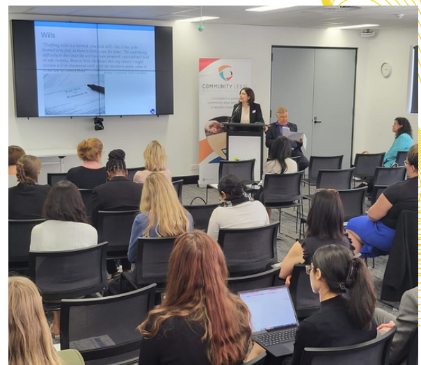
CAB PLO presenting during the CLWA Member Engagement Forum.

This opening gave the attendees an opportunity to reflect and consider whether they should be engaging in Will drafting and impressed upon the attendees, the seriousness of drafting Wills.